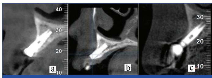
[Table/Fig-5]: a) Preoperatively; b) six months postoperatively; c) two year postoperatively.